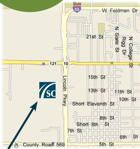
Springfield Clinic Lincoln